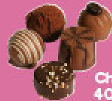
Chocolate, 40 cents