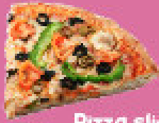
Pizza slice, 50 cents

Mummy gave Dan $2 for recess. Look at all the things he can buy with it at the canteen. Can you help him figure out how much change he'll get?