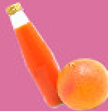
Fruit juice, 70 cents