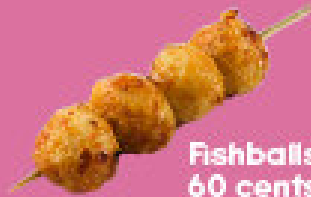
Fishballs, 60 cents